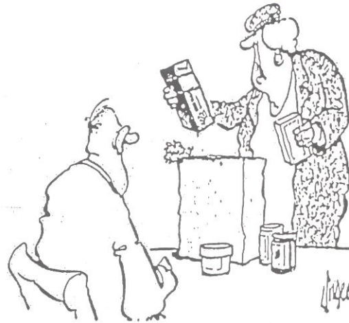
"I don't know what this is, but it's new and improved, so it must be good!"